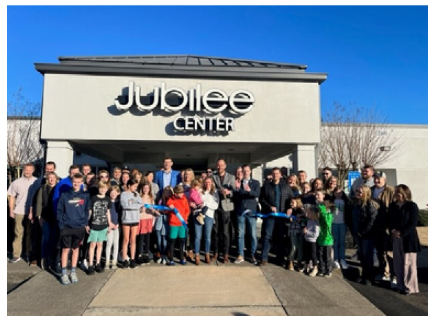
On January 20th, IN WDSK held a ribbon cutting celebrating Jubilee Church's Grand Re-Opening and Expansion.