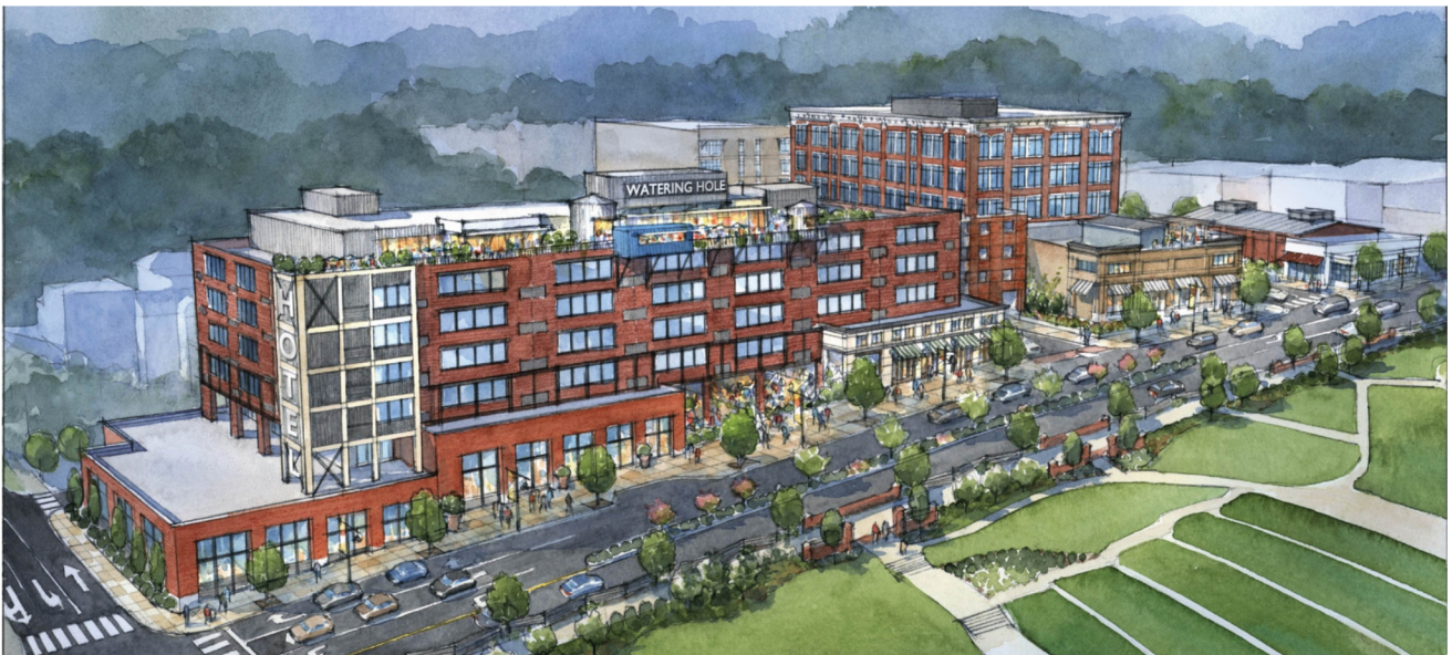
Rendering of Woodstock City Center

Help us build an economy in Woodstock that can lead the way to an even stronger community.