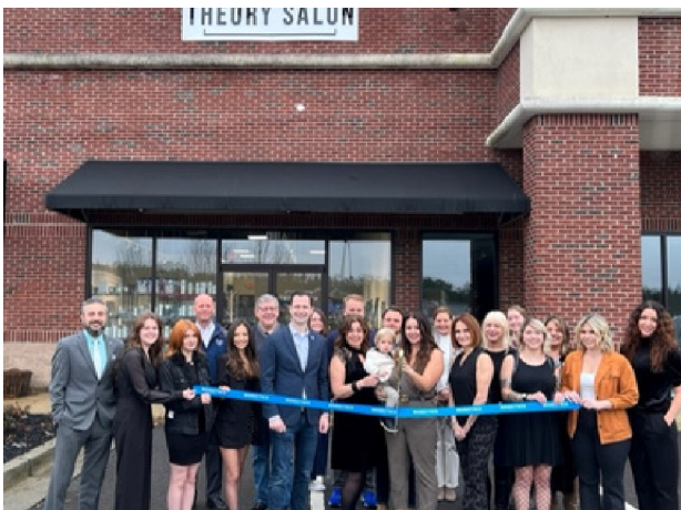
IN WDSK held a ribbon cutting to celebrate the grand opening of Theory Salon's new location in Woodstock on February 2nd.